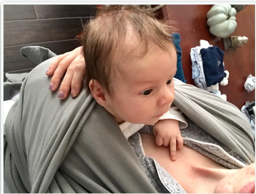
Awake in wrap or sling