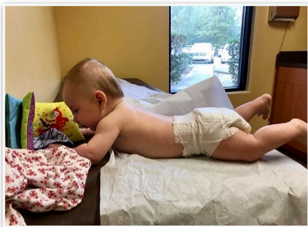
At the pediatrician's office