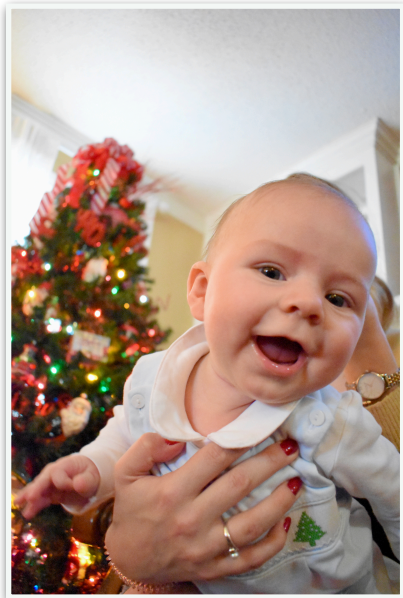
"Flying" on Mom's arm