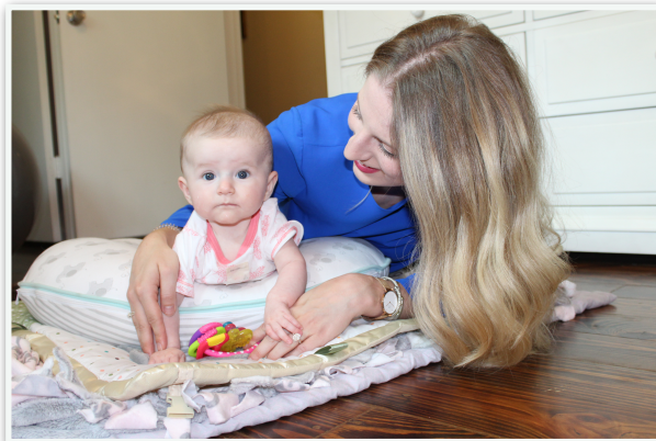
Over boppy with weight through hands