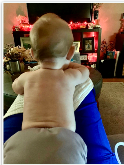
Inclined on knees