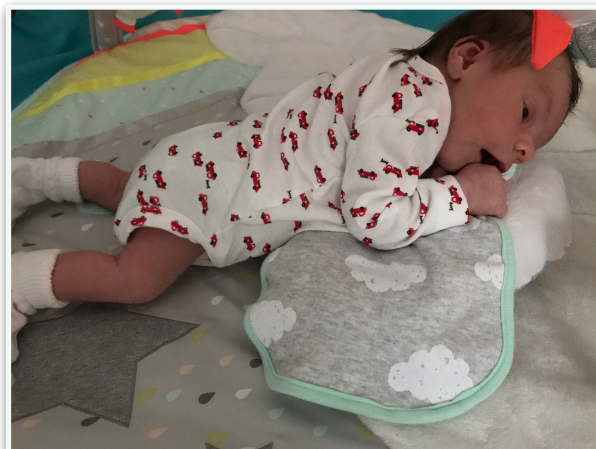
Chest propped on pillow