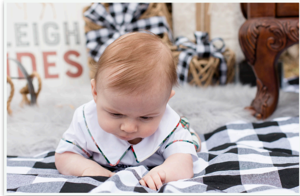
On a high contrast blanket