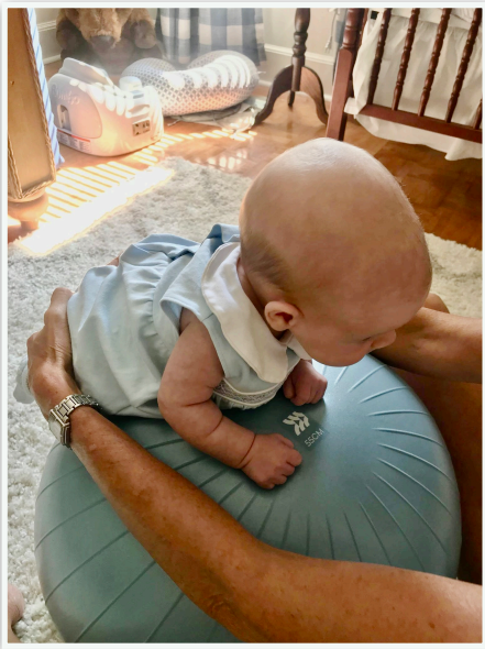
On a ball with support