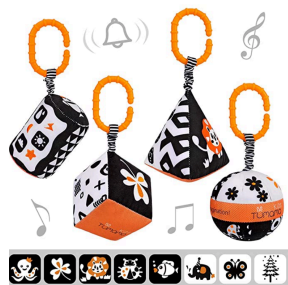
Dangling chime toys