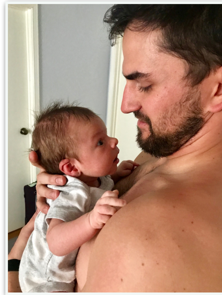
Talking with Daddy