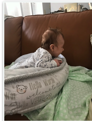
Over boppy on the couch