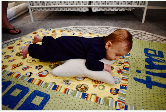
Chest supported on a high contrast blanket